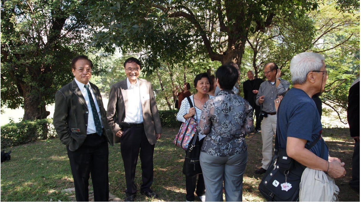
2011 November HK Golden Jubilee Reunion – 1 st left