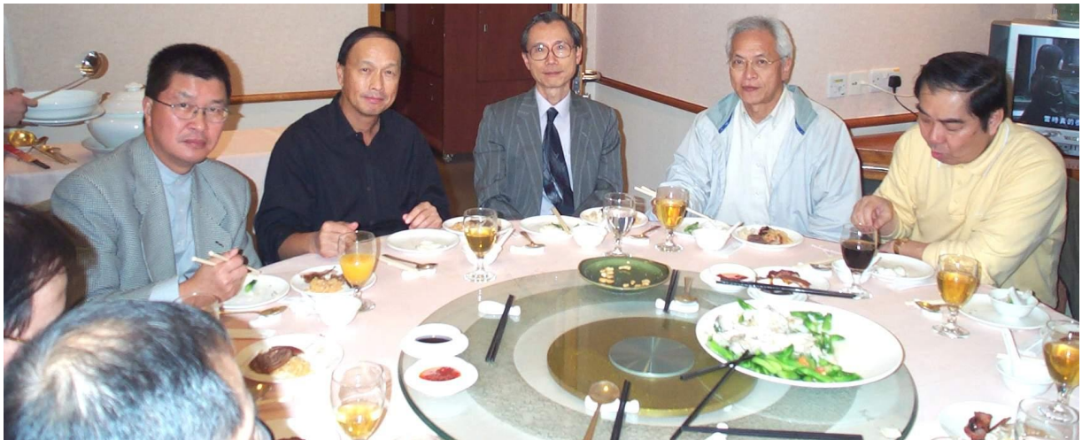
2004 December HK Reunion – 2nd right