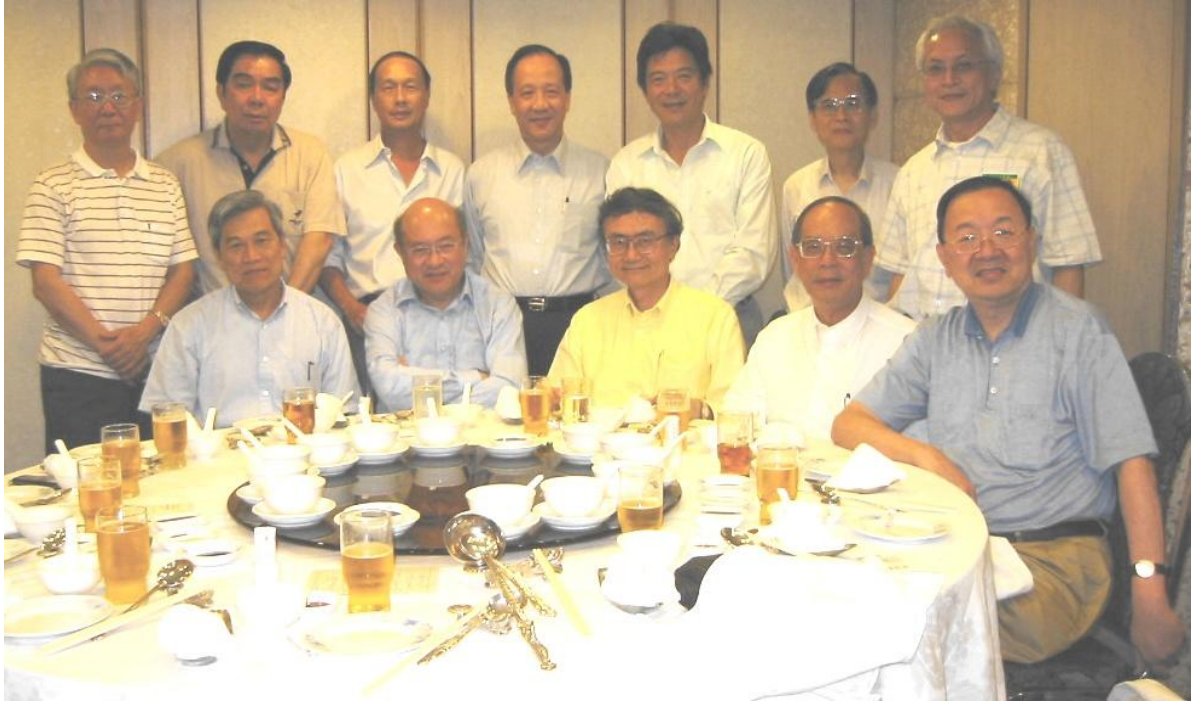
2004 May HK Reunion – top row – 1 st right