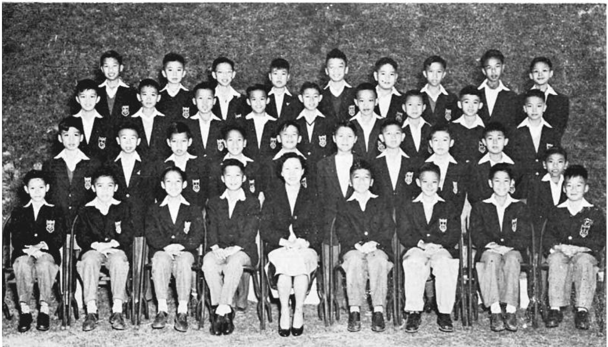
P6D, 1954-1955 – 2nd row from top – 1 st right