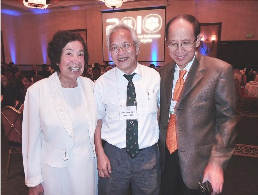
2010 International Conference, L.A. – 2nd left