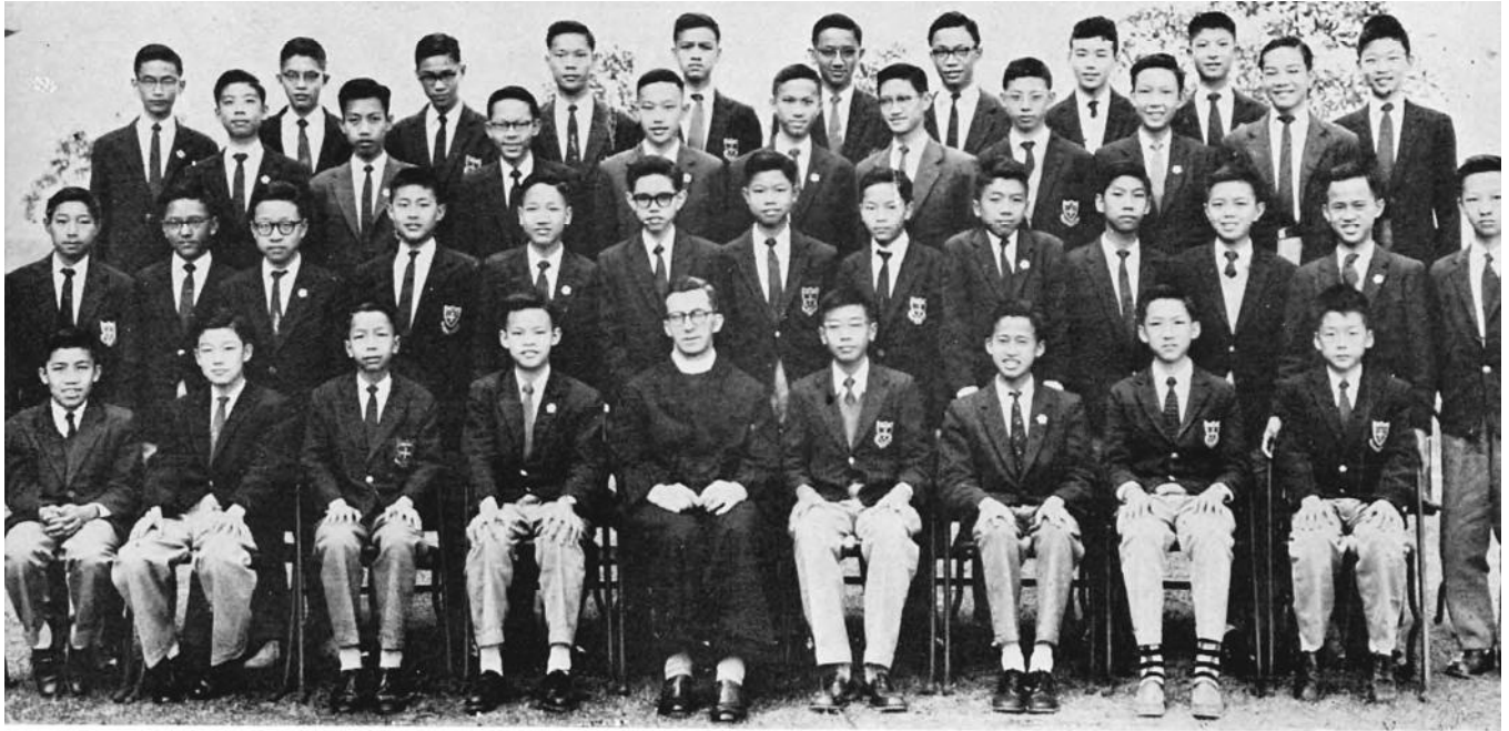
FORM III D.