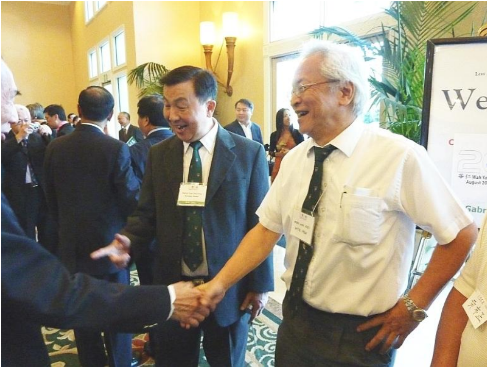
2010 International Conference, L.A. – 1 st right