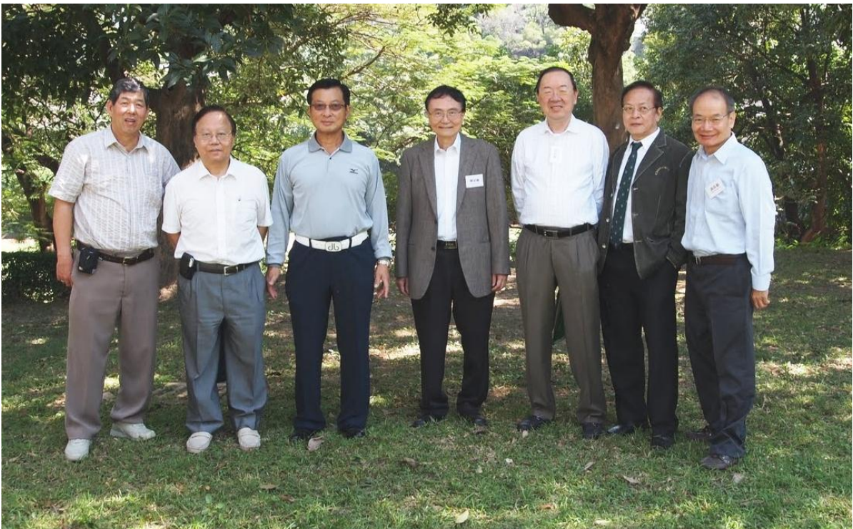
2011 November HK Golden Jubilee Reunion – 2 nd right