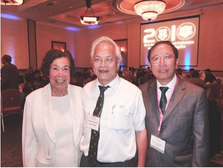
2010 International Conference, L.A. – 2nd left