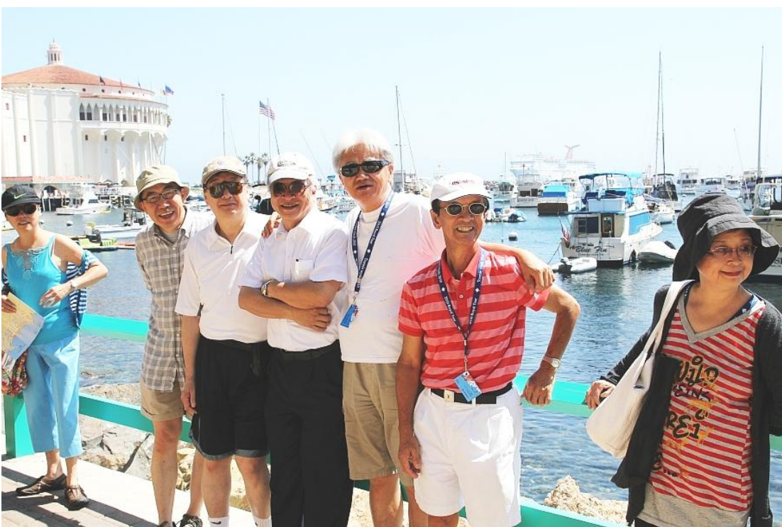
2010 International Conference – Catalina Cruise – 4 th left