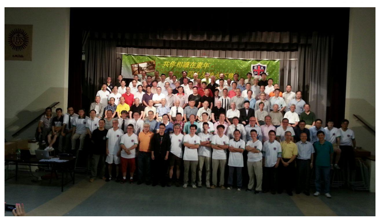
Reunion dinner of Class 1979 – 13 September 2014