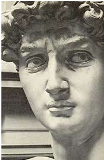
Watch his stare