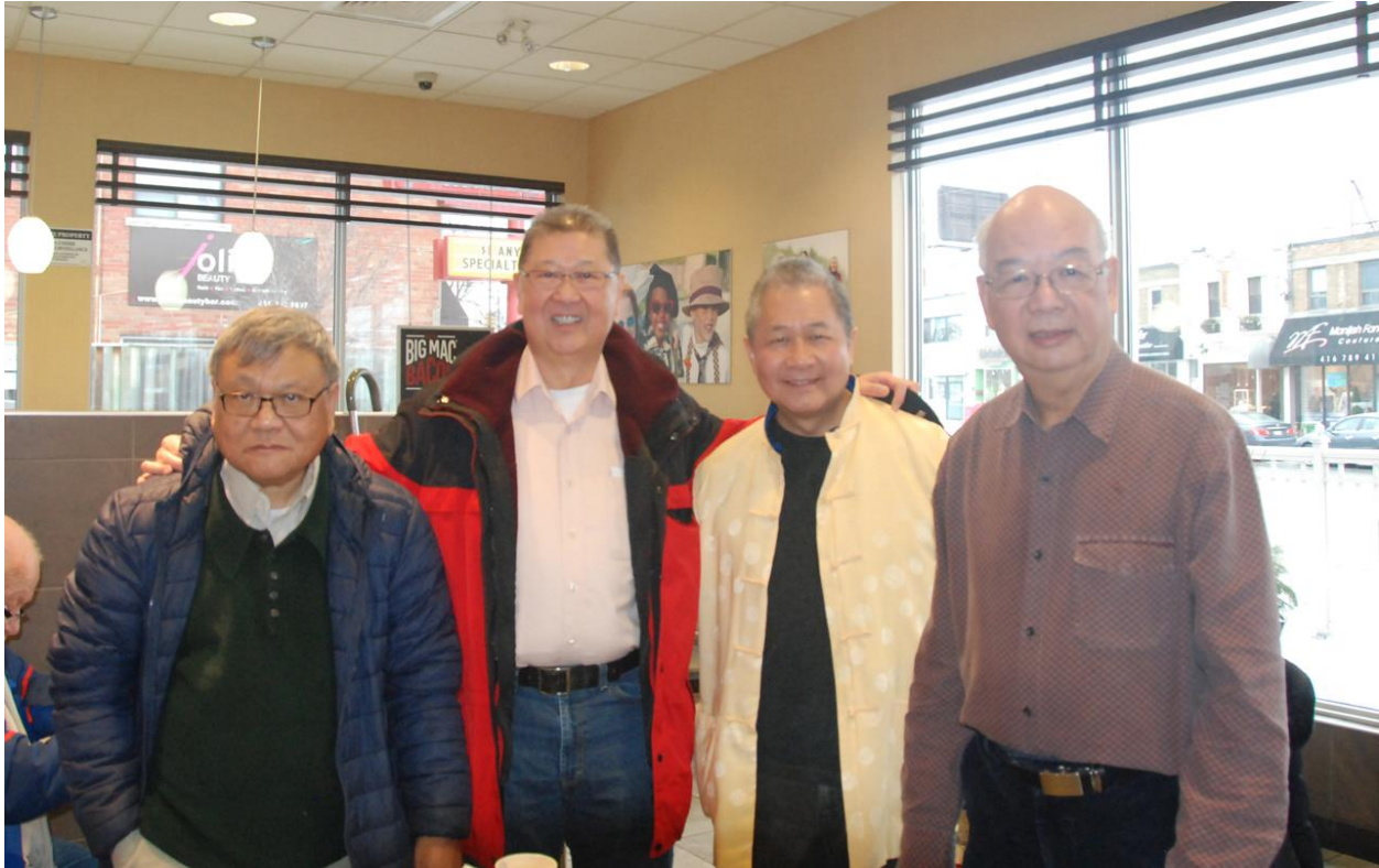
photo 9 – at McDonald's, 1890 Avenue Road, Toronto, after discussion.