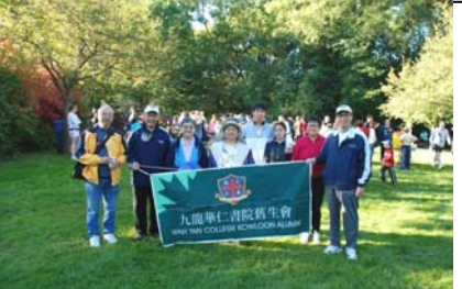
Terry Fox Run