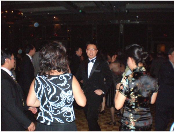
Dancing at VB