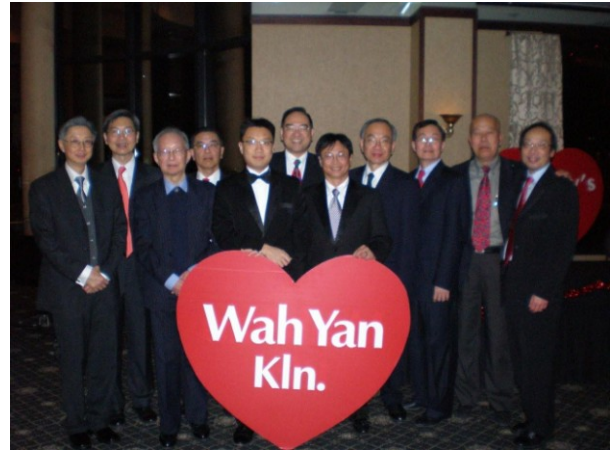
WYK group photo at VB