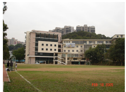
The 2005 extension