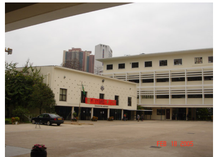
The 1990 extension