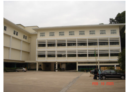
The 1968 extension

The four pictures, supplied by Martin Lee (1961), outline the growth of our school campus.