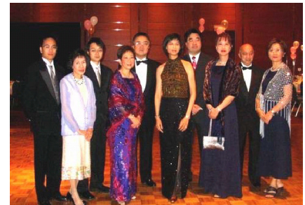
All the alumni presidents at VB2005

"...a highly successful Ball thanks to the Board members. We broke the old mould and we now celebrate the creation of a new and improved one..."