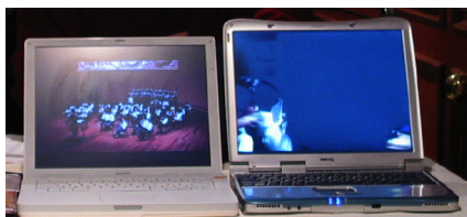
School magazine DVD and VCD's were available for viewing before the dinner