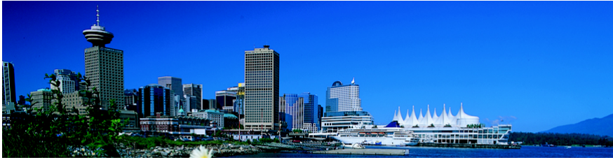
Vancouver, the venue of the upcoming IC2006

secondary schooling experience to the Canadian educational experience, and share the Wah Yan Spirit of community service especially in the Canadian context, and need not worry about leaving your wife and children lonely because they will be taken care in our arranged shopping trips;