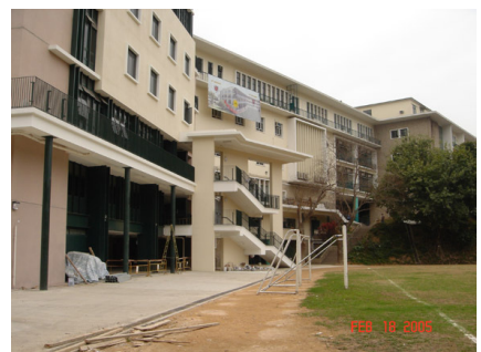
Close-up of the 2005 extension