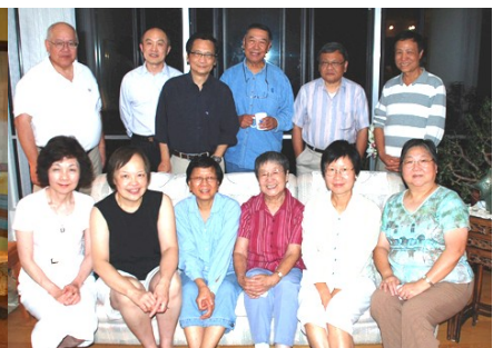
Class of 1965 with spouses at Gus' residence