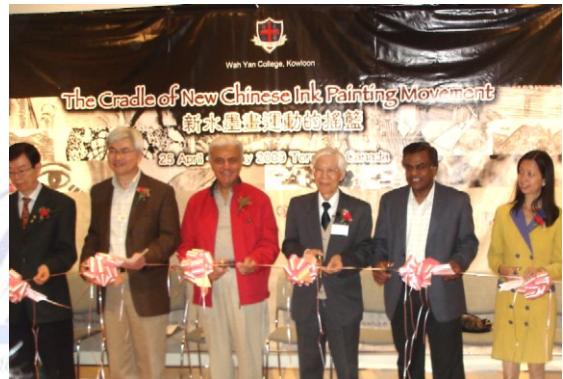
Opening ceremony at Chinese Cultural Centre

It had been hard and lengthy work to get the exhibition organised and we managed to attain our goal through the assistance and advice from members of WYKAAO.