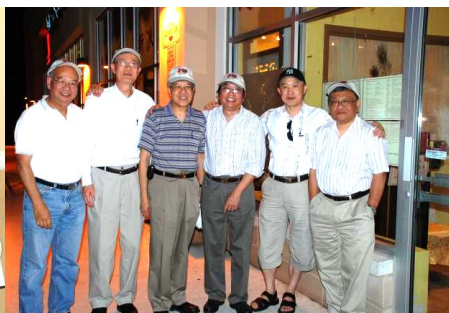
Class of 1965