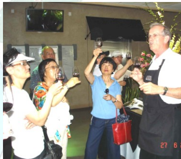
Left - Wine tasting Below - Toasting the President at lunch

Building on last year’s successful winery tour, WYKAAO presented an encore trip; this time to the renowned Niagara Culinary Institute on 27 th June. Tour of their wine making facility and wine tasting in the morning were followed by a delicious lunch in a leisurely pace that lasted until the mid afternoon. Click to see photo albums 1 , 2 and 3 here.