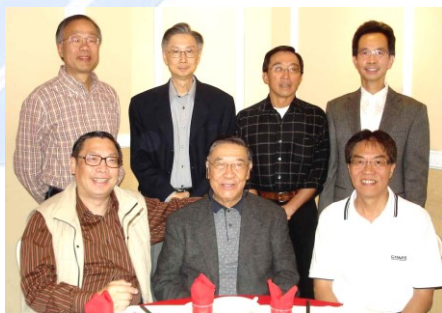
Wahyanites at James' party