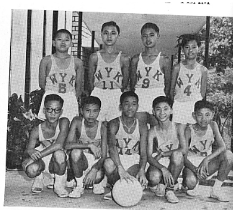
Basketball and ping pong – twin sport passions Junior Basketball Team, WYK (F3D, 1959)