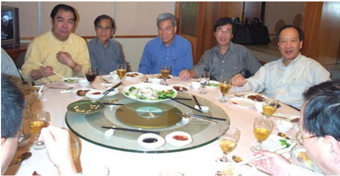
Relaxed, genial, a typical pose 2004-12, HK reunion