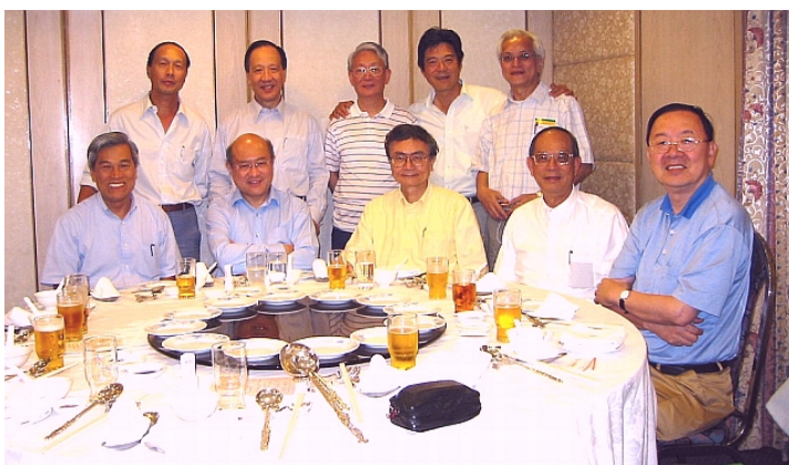
If you're happy and you show it 2004-05, HK reunion