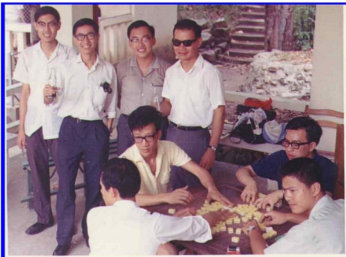
Honing his financial skills; one of many reunions to come 1966 summer reunion picnic, HK