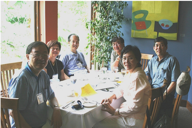
Sun, friends and wine – all mellow 2005-08, Toronto reunion (wine tour)