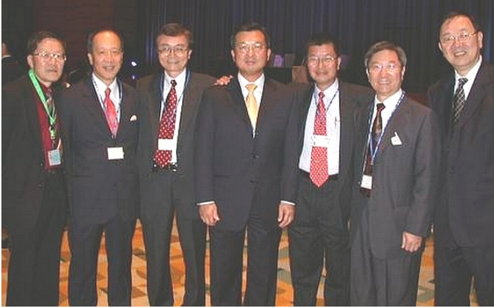
Timeless bonding in action 2004-11, HK, Wah Yan International Conference 2004