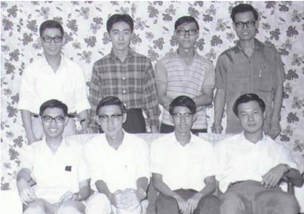
1966, another gathering with classmates – top row – 2 nd left