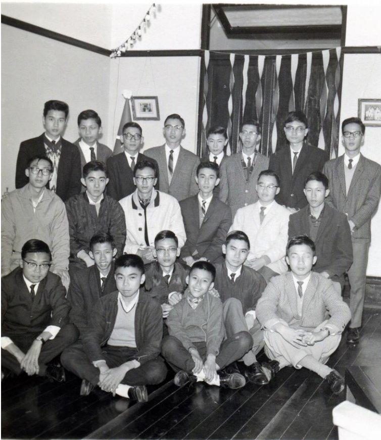
1961, at Andrew's farewell party – 2 nd row – 2 nd left