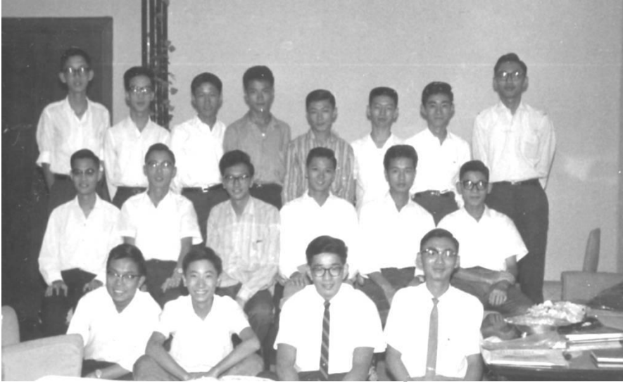
~1961, at a gathering – top row – 2 nd right