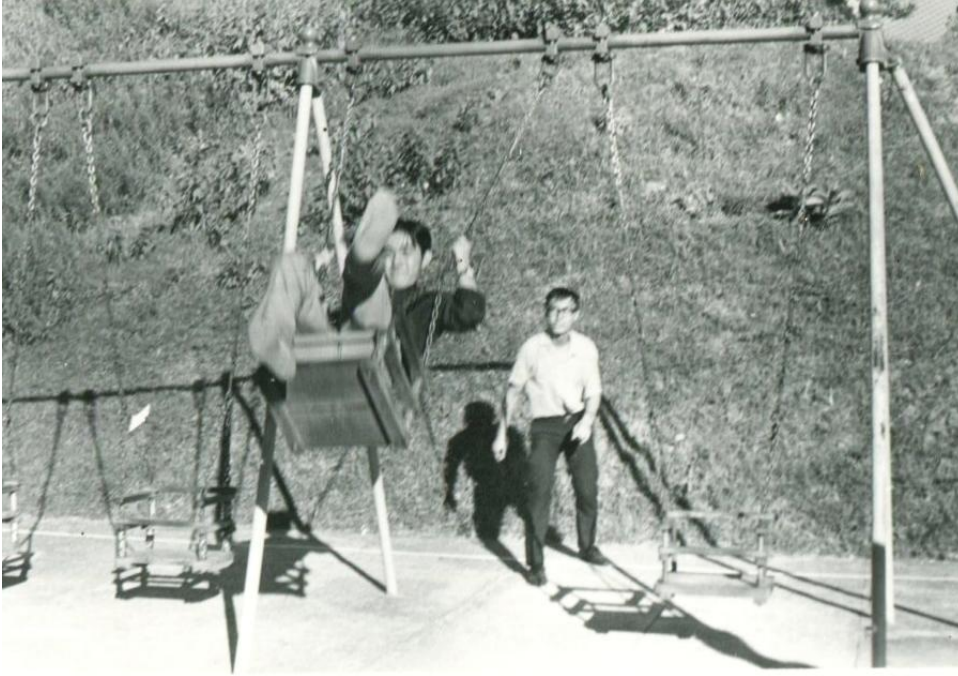
1969, having fun swinging