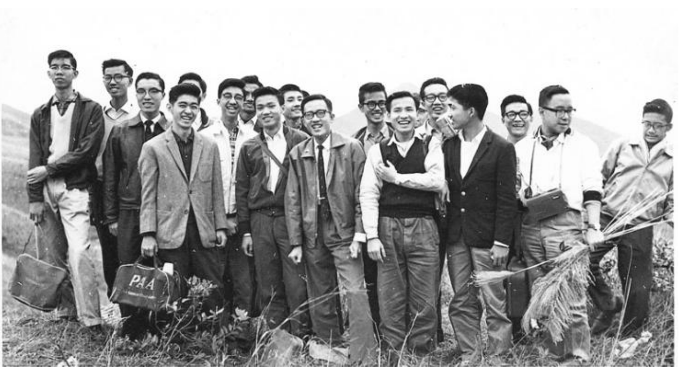
1962, '62 grads class picnic – 4 th left