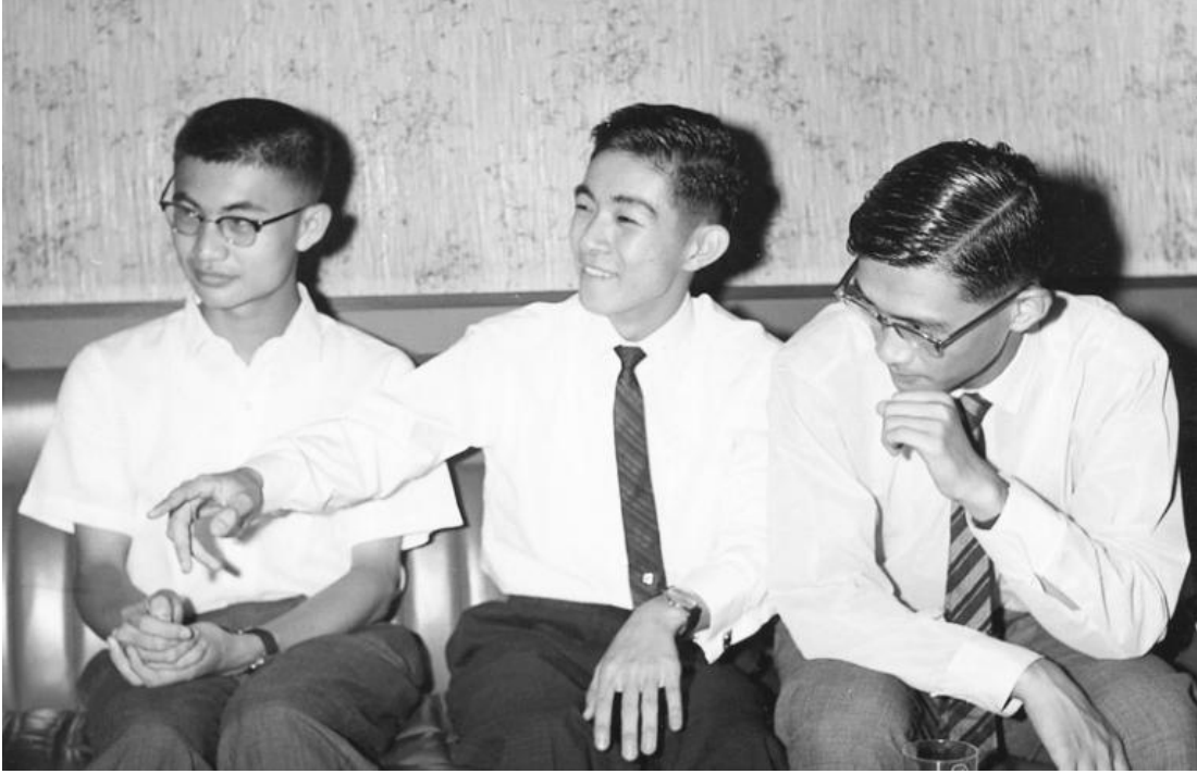
1962, with his '62 classmates