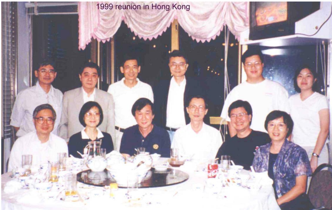
1999 reunion in Hong Kong