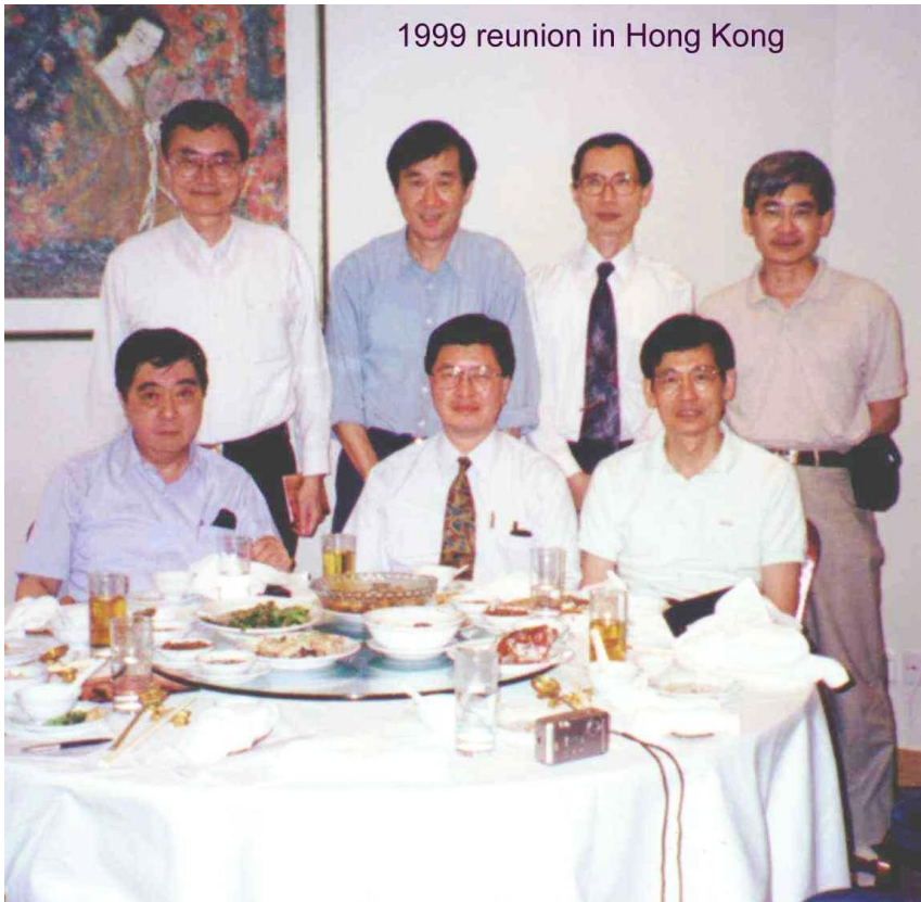
1999 reunion in Hong Kong