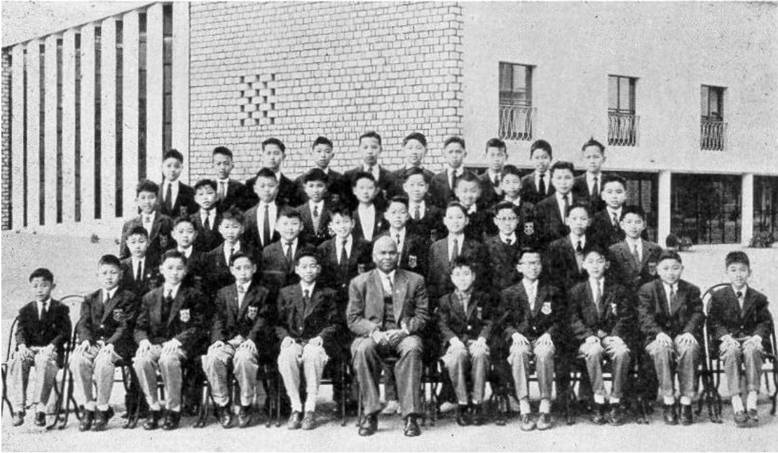
P6B, 1955-1956 – 2 nd row from bottom – 2 nd left