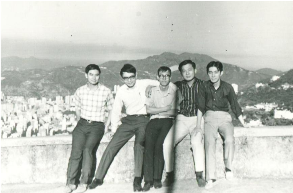
1969, with close friends again