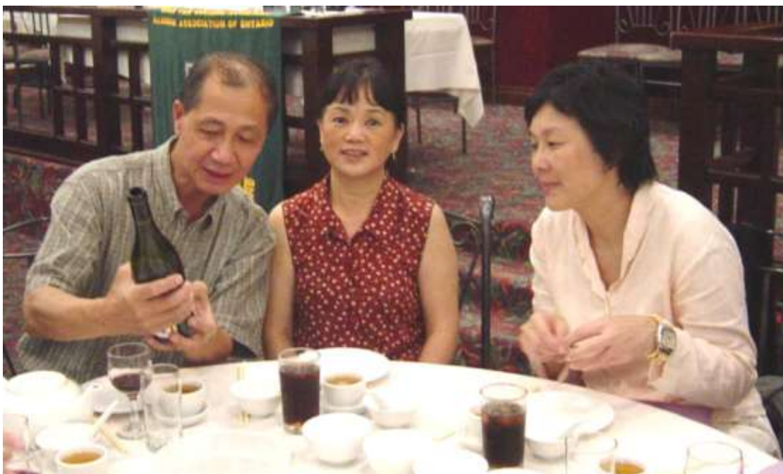
2005, Toronto Grand Reunion – joint dinner – 1 st left