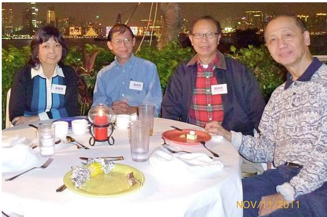
2011, HK Grand Reunion – 1 st right