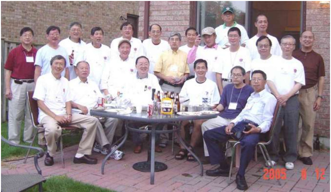
2005, Toronto Grand Reunion – BBQ - top row - 1 st right