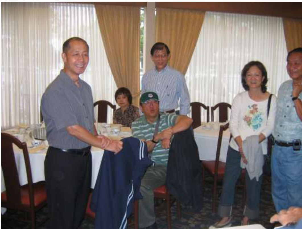
2008, Vancouver Grand Reunion – 1 st left