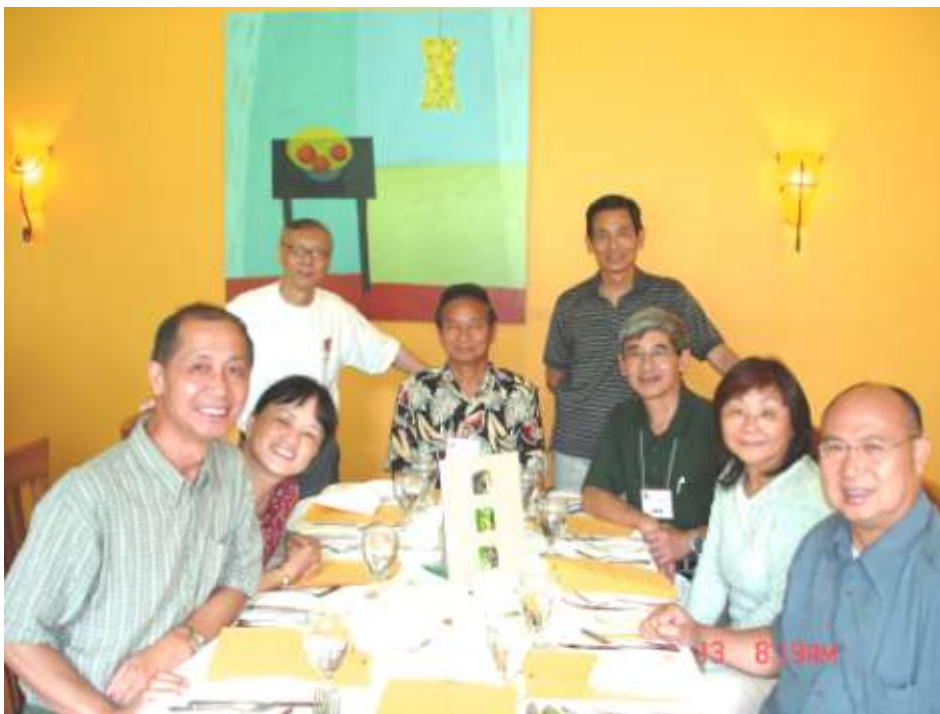
2005, Toronto Grand Reunion – wine tour – 1 st left