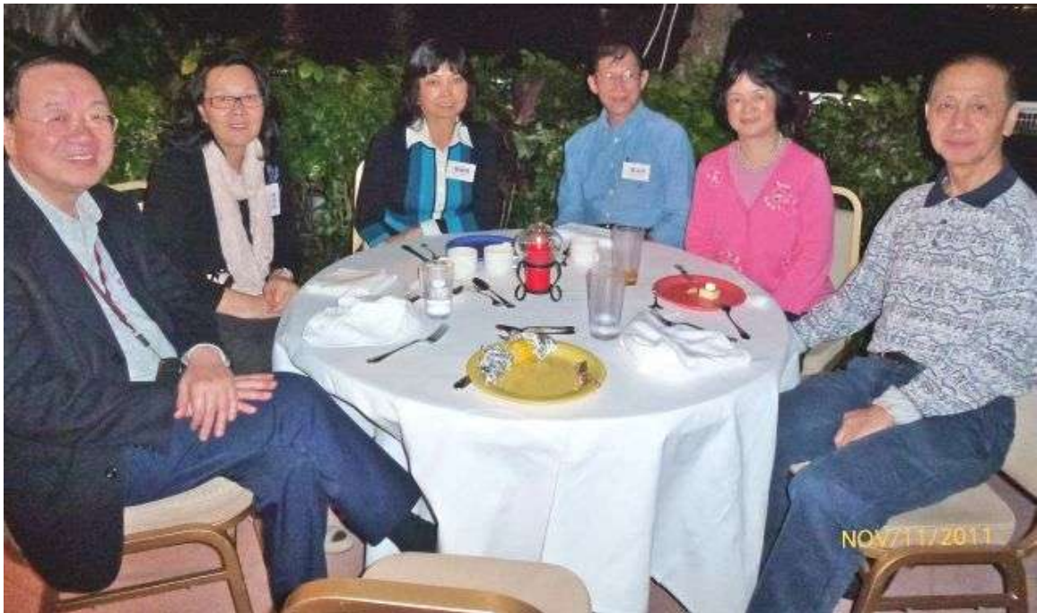
2011, HK Grand Reunion – 1 st right