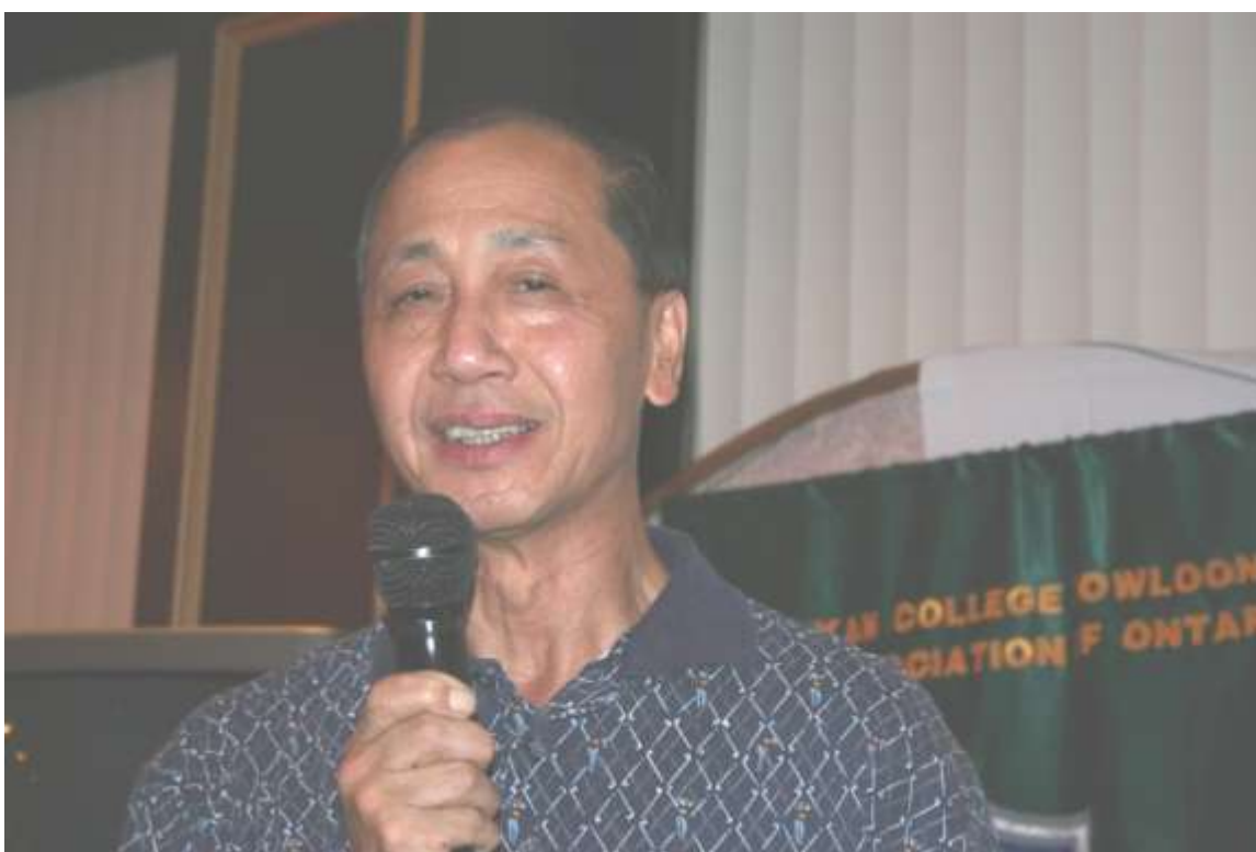
2005, Toronto Grand Reunion – gala dinner