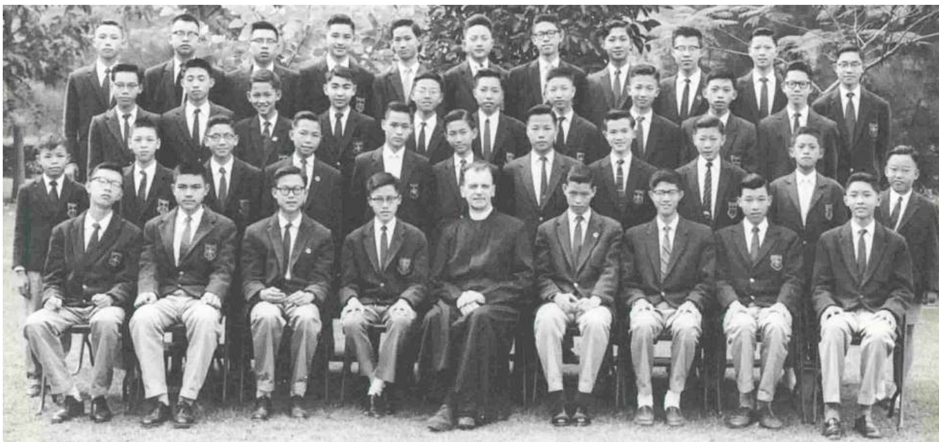
F3A, 1958-1959 – top row – 8 th left