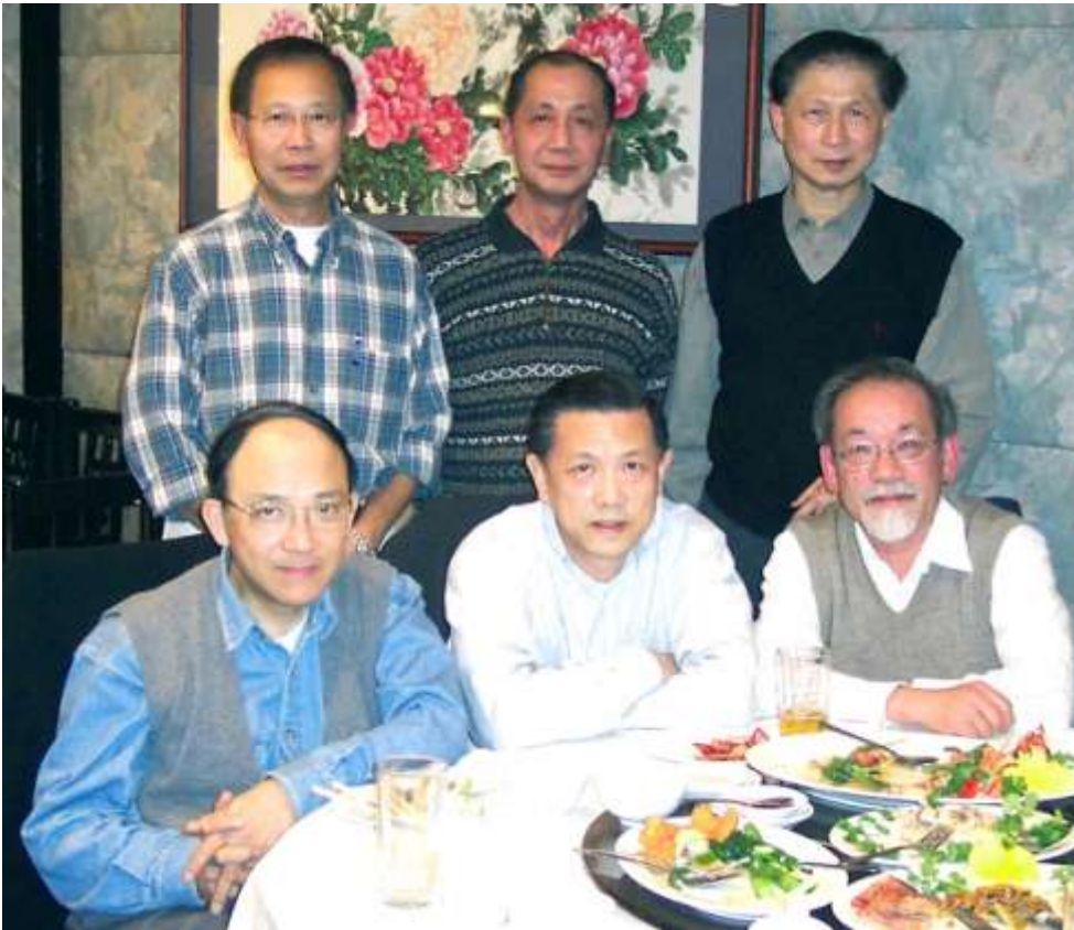
2005, Vancouver Reunion – standing - 2 nd left