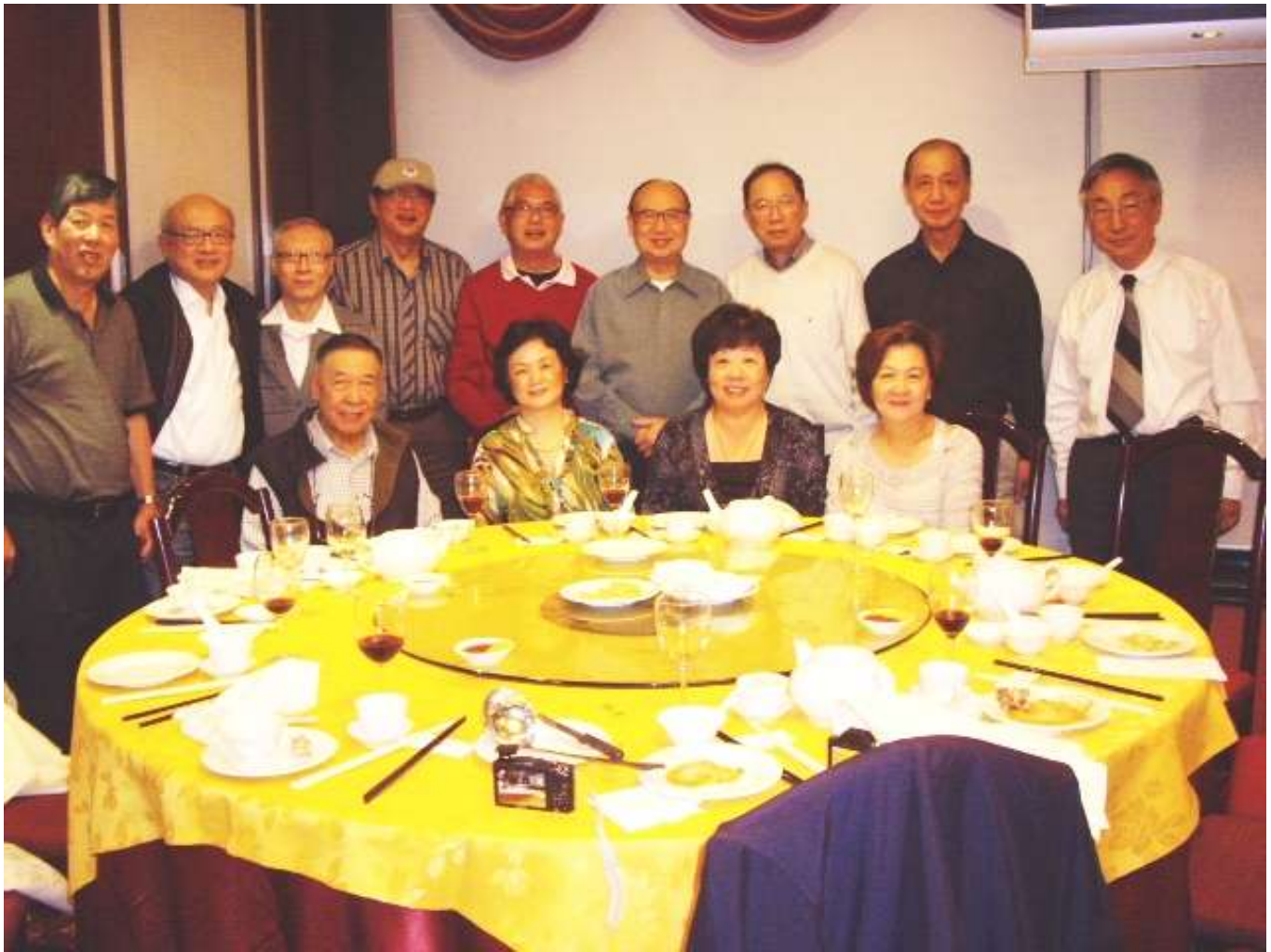
2012, Toronto Reunion – standing – 2 nd right