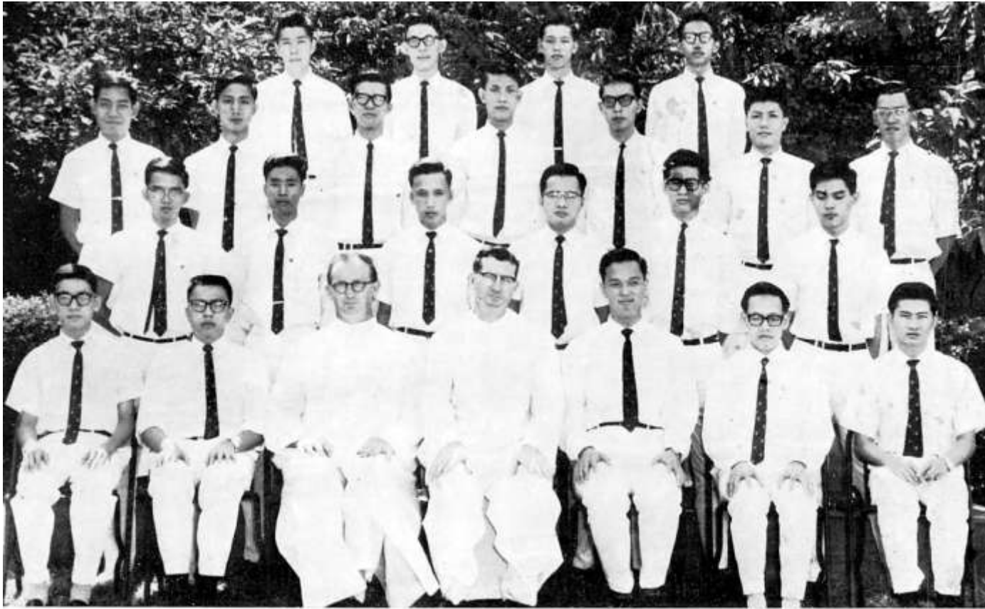
UPPER SIXTH ARTS

F7A, 1962-1963 – 2 nd row from top – 2nd left