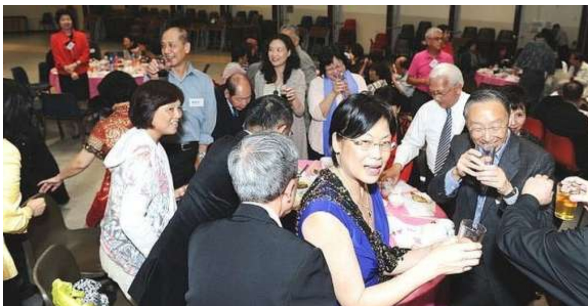
2011, HK Grand Reunion – 2 nd left