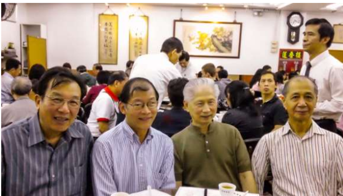
2011, HK Grand Reunion at a teahouse restaurant – 1 st right