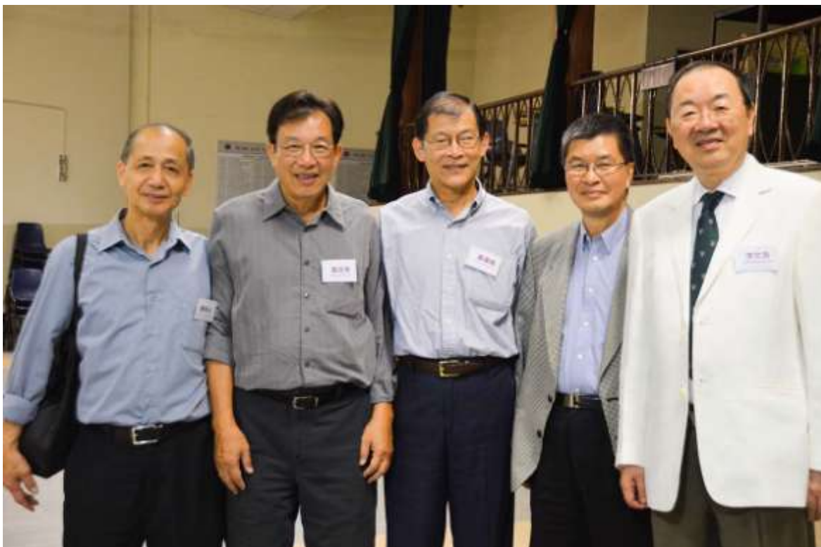
2011, HK Grand Reunion – 1 st left