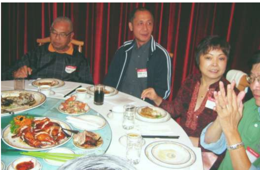
2008, Vancouver Grand reunion – 2 nd left