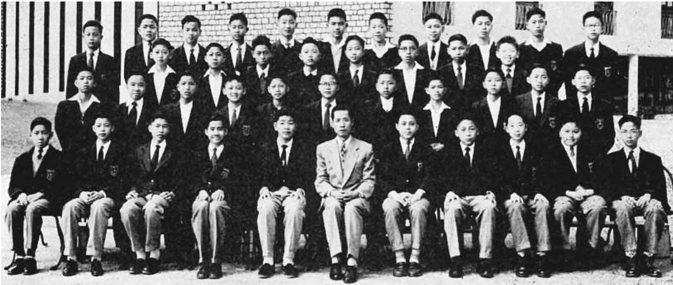
P6A, 1955-1956 – 2 nd row from top – 2 nd left