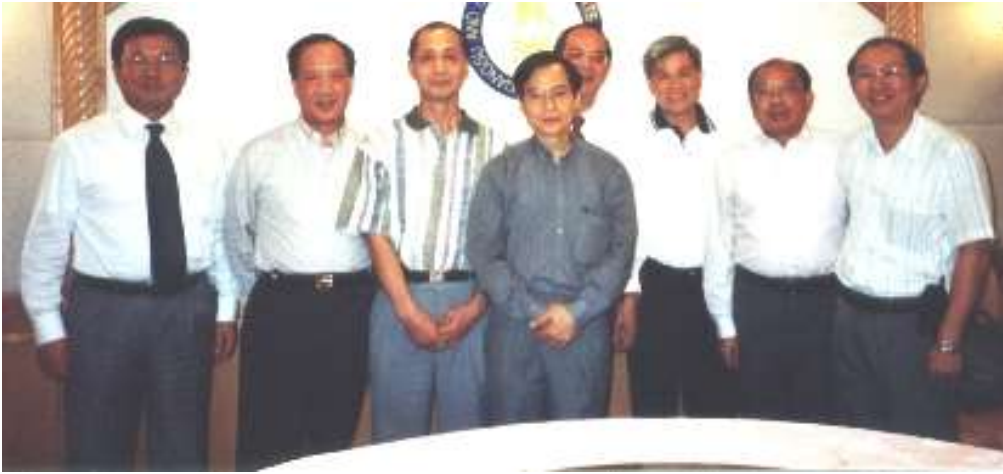
2001, HK Reunion – 3rd left