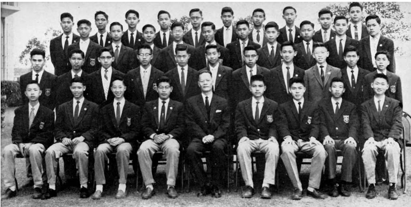
FORM II A.