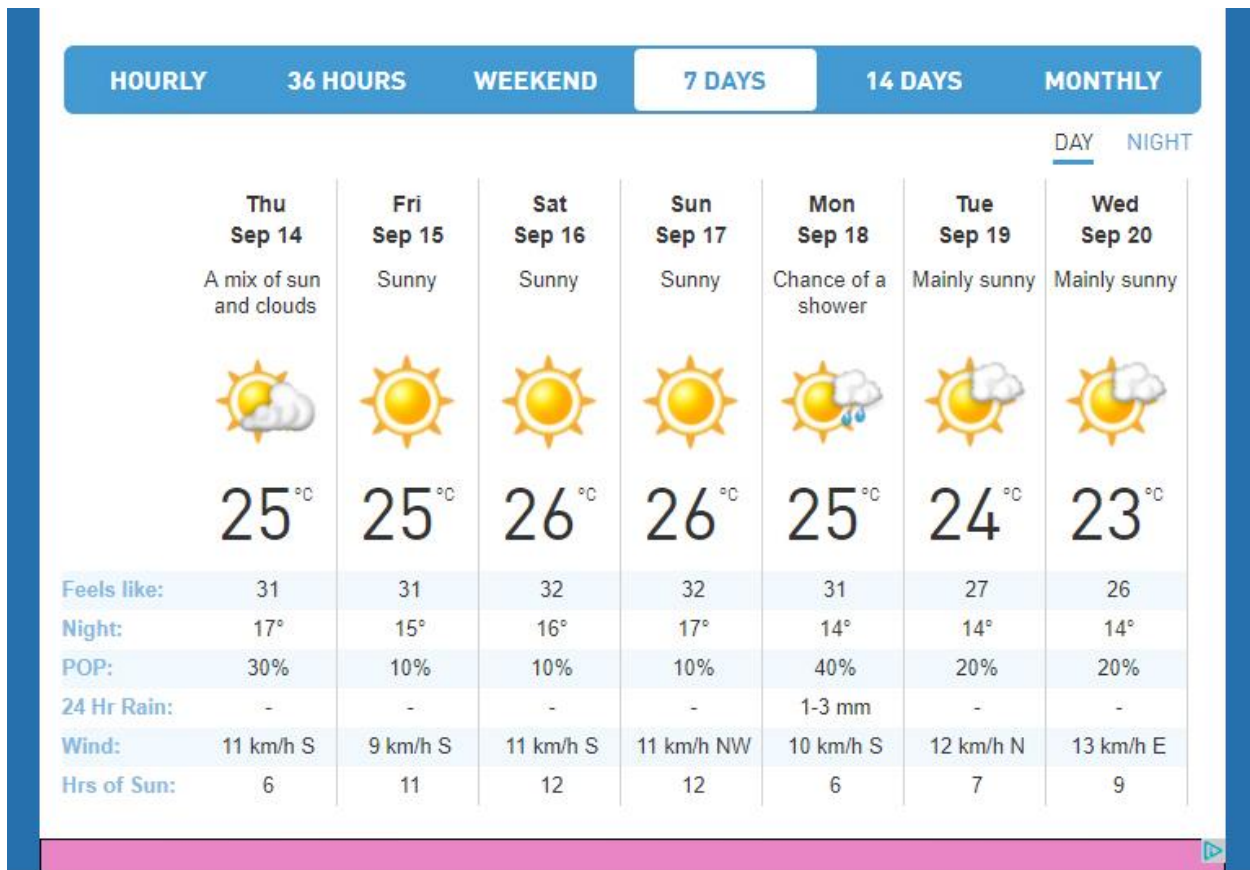
photo 12 – weather forecast 14 th - 20 th September, 2017 in Toronto, Ontario