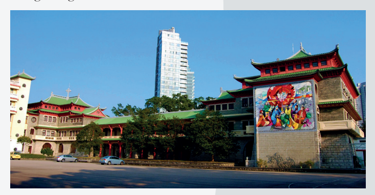
the Holy Spirit Seminary

Generally not open to public, the Holy Spirit Seminary is not only a base for seminarians who would be ordained to priesthood, but home to the rich history and culture of the Catholic Church in Hong Kong and in South China.