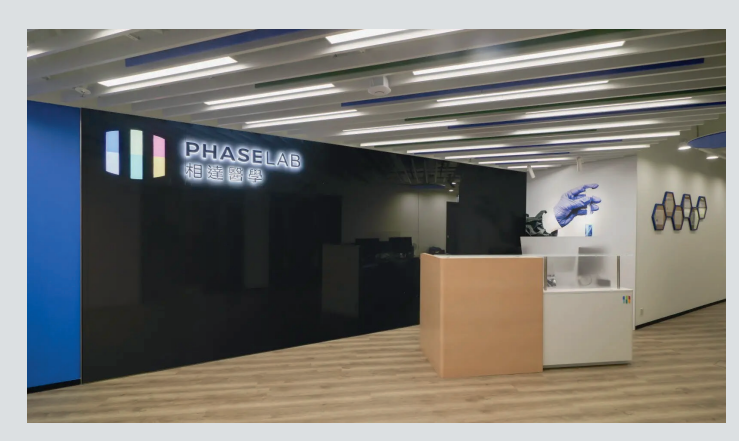
Phase Scientific, set up by WYK graduate Ricky Chiu ('00)

19<sup>th</sup> December 2024 (Thu): Campus tours to WYCHK and WYK, followed by the main conference programme at WYK