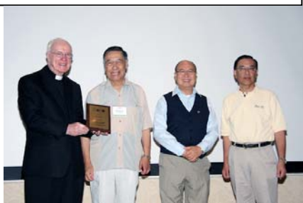
Receiving the Best Website Award at IC 2010