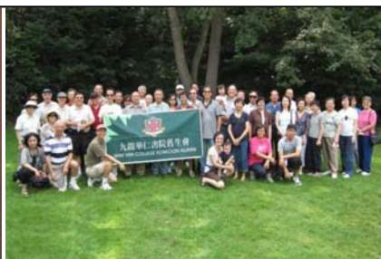
Picnic at Serena Gundy Park