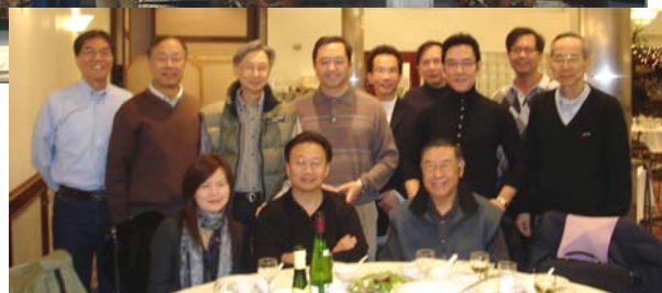
Class of 1967 Toronto reunion